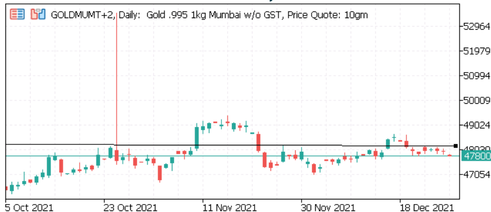
RSBL Gold Daily Price Chart