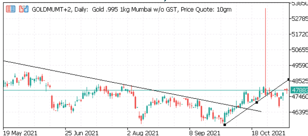
RSBL Gold Daily Price Chart