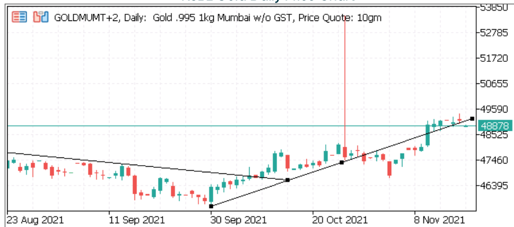
RSBL Gold Daily Price Chart