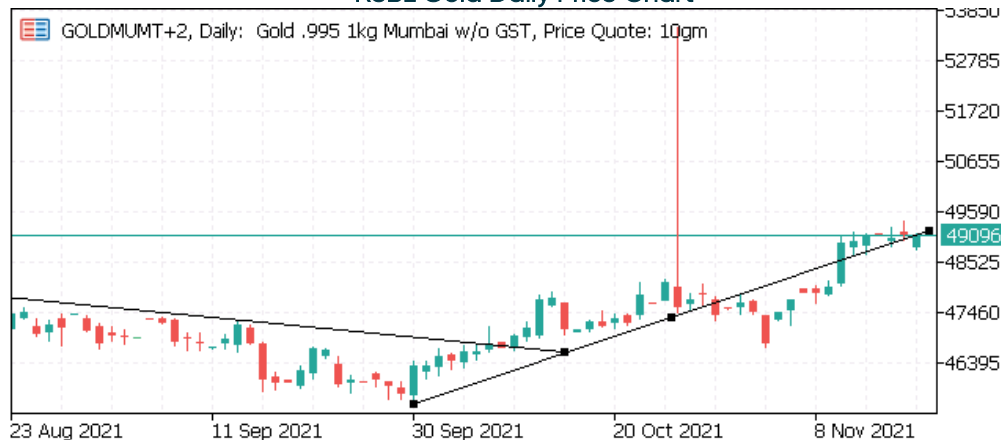
RSBL Gold Daily Price Chart