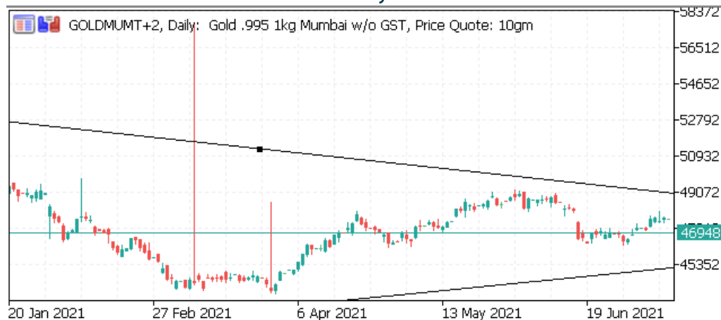
RSBL Gold Daily Price Chart