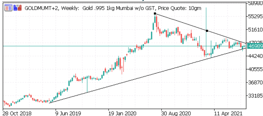
RSBL Gold Weekly Price Chart