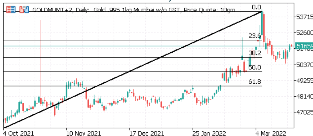
SPOT Gold Daily Price Chart